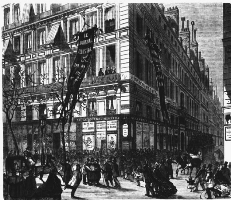
ASPECT DE L'ANGLE DU BOULEVARD MONTMARTRE ET DE LA RUE RICHELIEU LE JOUR DE L'APPARITION D'UN NUMÉRO DE Journal illustré . Dessin d'H. de HEN.