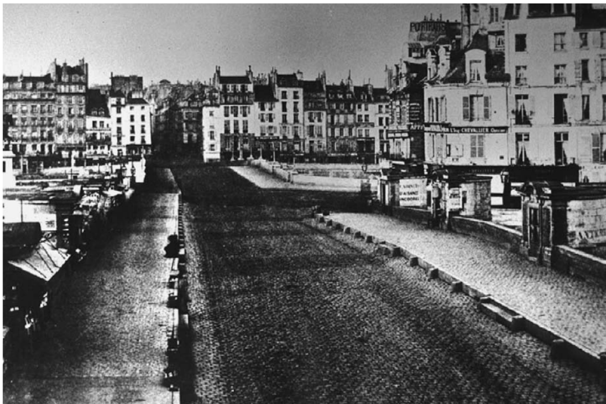
Fig. 4.2 The Pont Neuf in Paris , Marville photograph, 1852: Bibliothèque Historique de la Ville de Paris