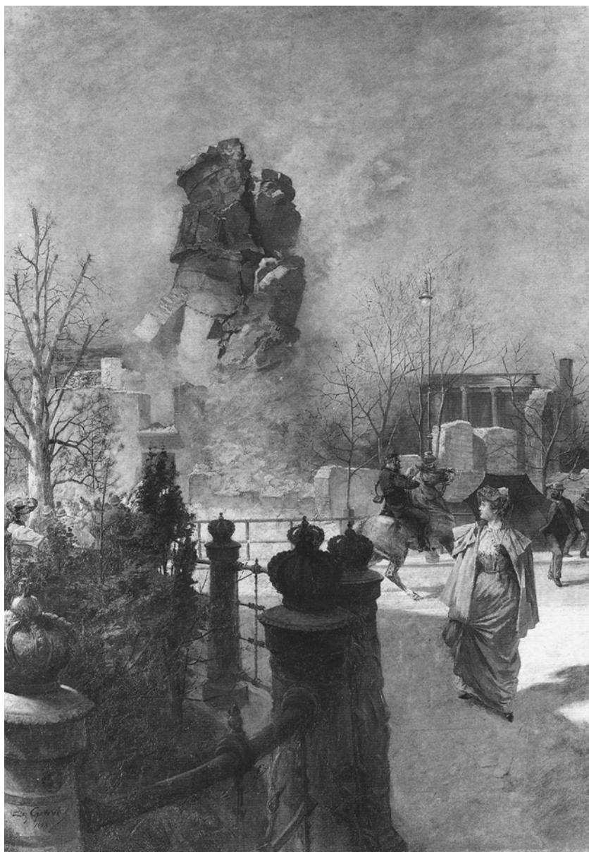
Fig 10.2 Fritz Gehrke, Die Sprengung des alten Doms [ The Explosion of the Old Cathedral ], 1893