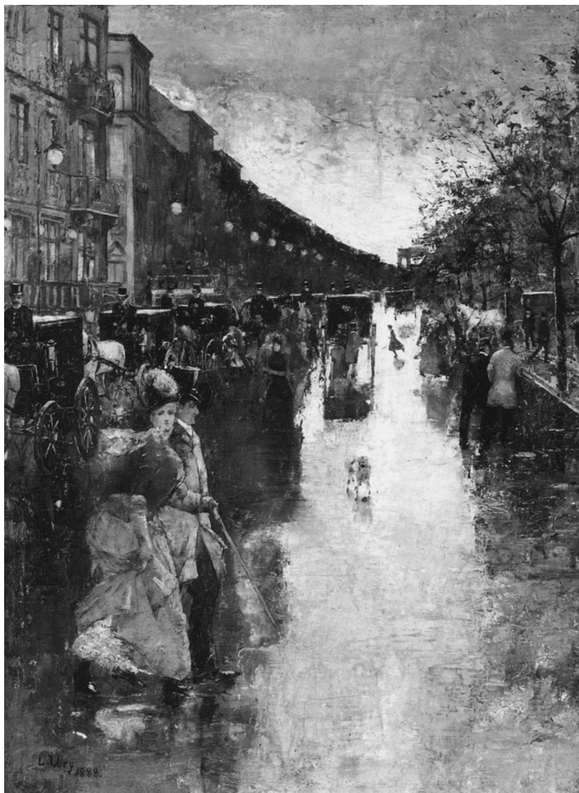
Fig 10.1 Lesser Ury, Unter den Linden , 1883