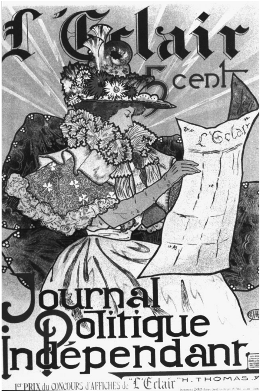
Fig 4.2 Poster for L'Éclair , 1895. Roger Marx, Les Maîtres de l'affiche , Paris: Chaix, 1896–1900